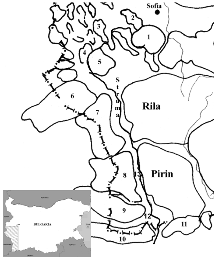
Fig. 1. Mountains and localities in Southwestern Bulgaria: 1 – Vitosha Mts.; 2 – Lyulin Mts.; 3 – Karvav Kamak Mts.; 4 – Zemen Mts.; 5 – Konyavska Mts.; 6 – Osogovska Mts.; 7 – Vlahina Mts.; 8 – Malashevska Mts.; 9 – Ograzhden Mts.; 10 – Belasitsa Mts.; 11 – Slavyanka Mts.; 12 – Struma Valley, Rupite place; 13 – Kresna Gorge (after NIKOLOV & JORDANOVA (2002) with modifications).

Abbreviations: HNHM – Hungarian Natural History Museum, Budapest; MHNG – Muséum d'histoire naturelle, Genève; NMNHS – National Museum of Natural History, Sofia; ZMHB – Museum für Naturkunde der Humboldt Universität, Berlin; SNHM – Slovak National museum, Natural History Museum, Bratislava; DEI – Deutsches Entomologisches Institut, Eberswalde; PCPH – collection Peter Hlaváč, Košice; PCRB – collection Rostislav Bekchiev, Sofia; PCVB-collection Volker Brachat, Geretsried; * – new species for Bulgaria; ** – new genus for Bulgaria.