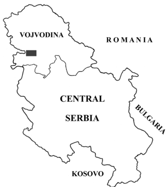
Fig. 1. Administrative map of Serbia. The black rectangle indicates the position of the Fruška Gora Mt.

s. – specimen/s; m. – male/s; f. – female/s