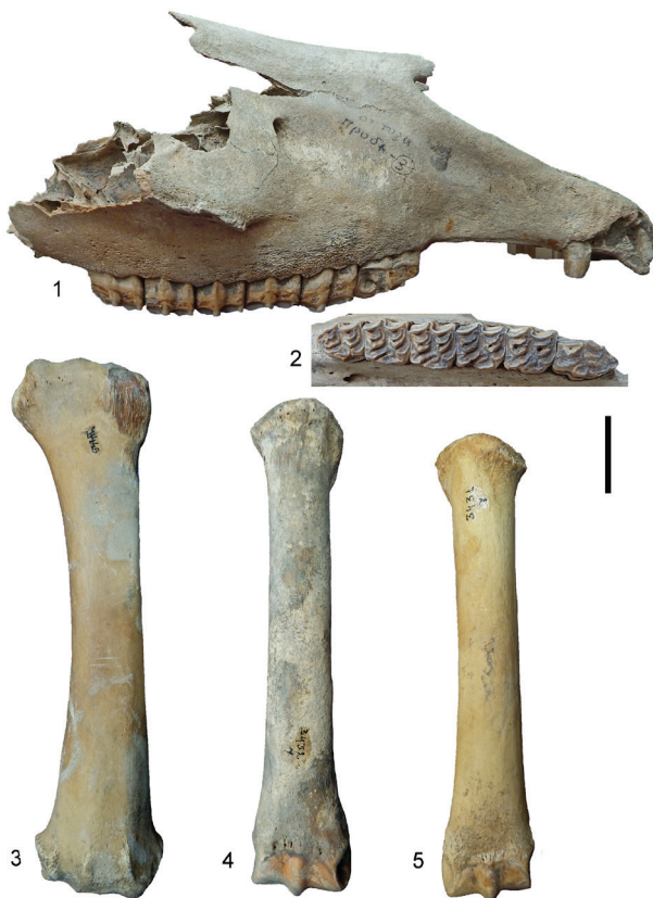
Fig. 1. Horse bones from Urdoviza: 1 – skull FM 3460, male; 2 – occlusal view of the check teeth of skull FM 3460; 3 – humerus FM 3445; 4 – metatarsus FM 3432; 5 – metatarsus FM 3431

About 70% of the bones are from wild animals, among which the ones of red deer, aurochs and wild boar are prevailing. The small ruminants predominate among the bones of the domestic animals.