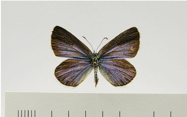
Fig. 7. Plebejus christophi , ♀.