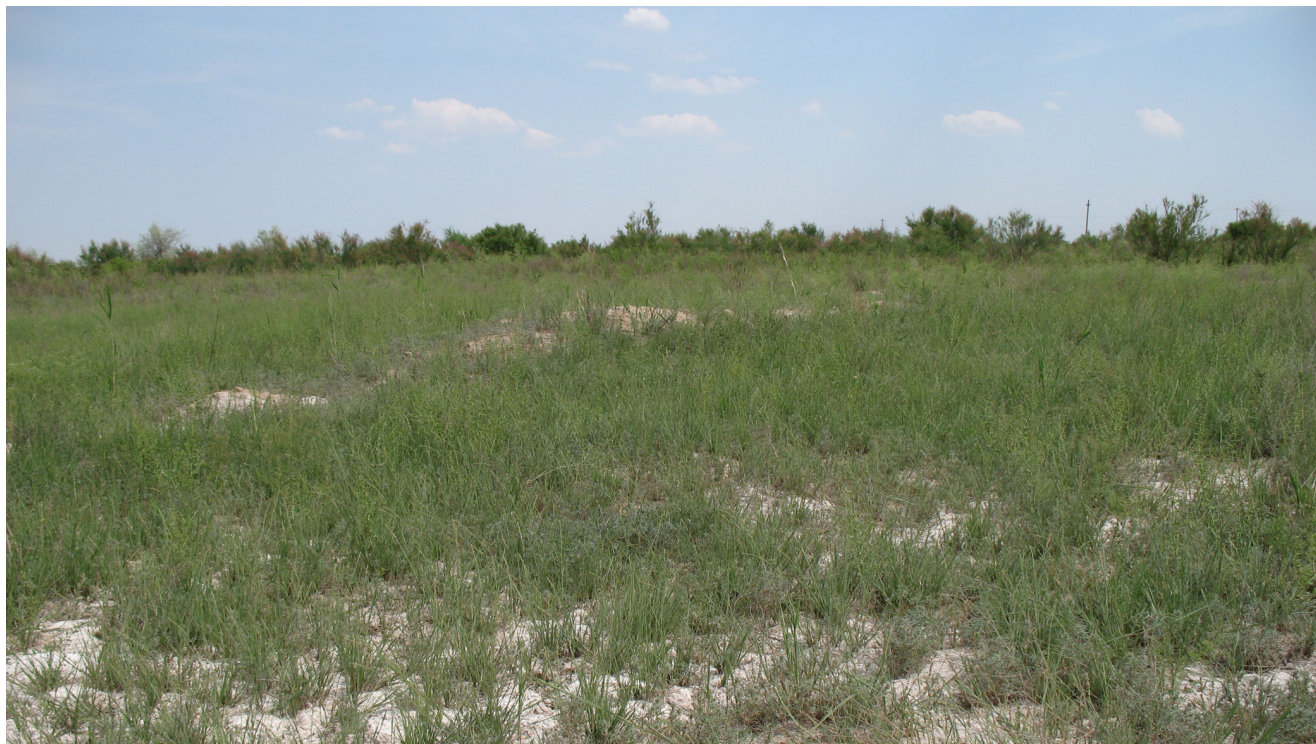
Fig. 5. Saline soil habitats in Syrdarya River Valley, S of Kazakhstan Village [waypoint 4], habitat of Plebejus elvira .