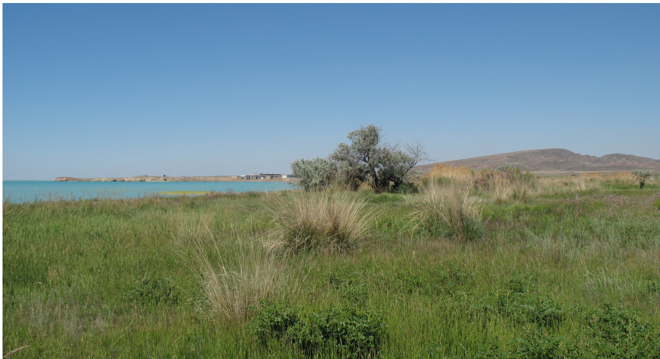
Fig. 3. Western Balkhash Lake Shore, E from Gulshat Village [waypoint 13], habitat of Amata caspia , Plebejus christophi .