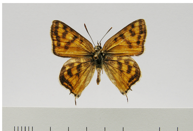
Fig. 2. Cigaritis epargyros , ♀.

♂♂. Widespread in the southern part of Kazakhstan (Tshikolovets et al., 2016: 123).