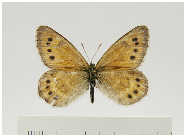
Fig. 11. Oeneis tarpeia , ♂.

Hyponephele narica (Hübner, [1813]) – [waypoint 10] Kyzylorda Province, Dar'yalyktakyr Plain, 30 km ESE from Kyzylorda, 44°43.129' N, 65°52.895' E, 135 m, 24 May 2015 – 2 ♂♂, 1 ♀ (Fig. 10). Widespread in the southern part of Kazakhstan (Tshikolovets et al., 2016: 267).