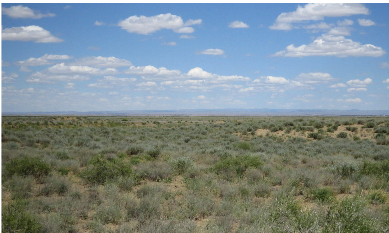
Fig. 4. Border area between Syrdarya Valley and Kyzylkum Desert, WSW of Besh-Aryk Village [waypoint 9], habitat of Cigaritis epargyros .