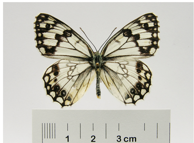
Fig. 9. Melanargia parce , ♂.

Hyponephele lycaon (Rottemburg, 1775) – [waypoint 8] South Kazakhstan Province, Turkestan District, 6 km W of Shilik Village, 42°53.334' N, 68°44.026' E, 200 m, 22 May 2015 – 1 ♂, 3 ♀♀. Southernmost locality in the country. Previously known localities are