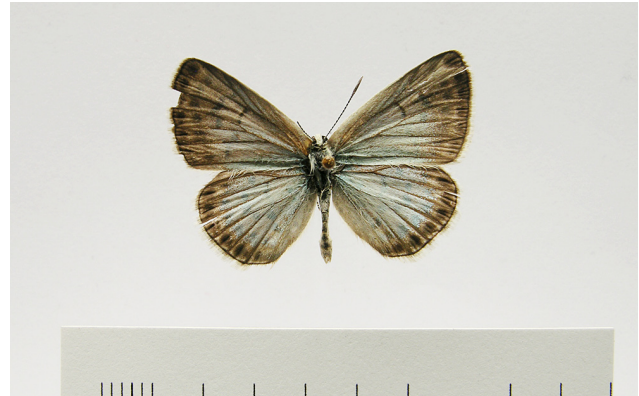
Fig. 8. Plebejus elvira , ♂.

bution further west in the central part of the country to Syrdarya River Valley.