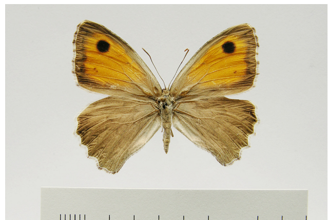
Fig. 10. Hyponephele narica , ♀.

situated in the northern and southeastern parts of Kazakhstan (Tshikolovets et al., 2016: 258).