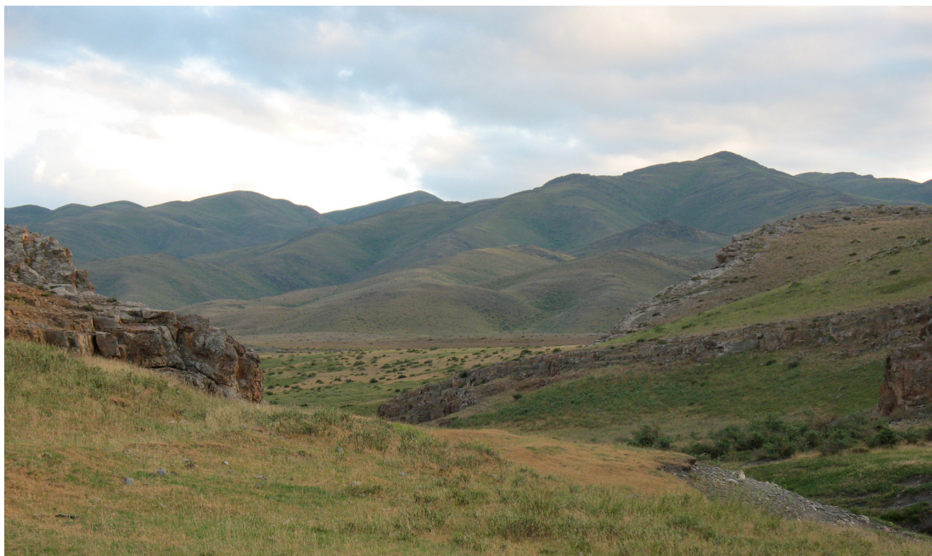
Fig. 6. Karatau Mts, S of Karabastau Village [waypoint 2], habitat of Melanargia parce .